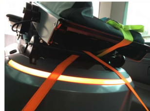
(d) Hinten Details