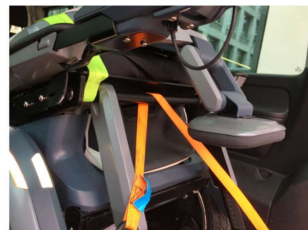
(b) Vorne Details