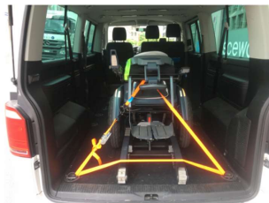
(a) Sicherung vorne